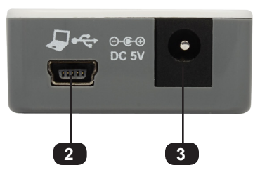
page | 2