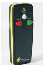
Laser Handset 2 Button