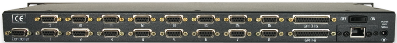
GangWay16 Rear Panel

You can communicate with GangWay16 over LAN or over the internet, for remote control and switching. It's ideal for remote truck or studio applications. ES-SloMo J RS-422 and SloMo Mini RS-422 can directly interface with GangWay16 to provide for control up to 16 RS-422 recorders.