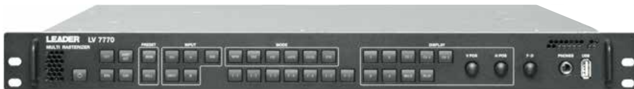
LV7770 Multi SDI Rasterizer