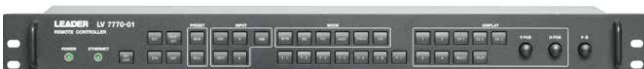
LV7770-01 Remote Controller