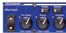
Dual Independent Controls for each Processor.

Those using the MX200 in the live arena will appreciate its intuitive front panel layout, with an Active Reverb/ Effects Matrix that constantly displays which two of the 32 available effects are active, and all functions available within a single button-push turn of a knob. Dual independent processor control areas with dedicated Effects Select, Tempo, Bypass and three parameter control knobs provide instant access with precise and meaningful control over the most critical parameters for the selected effect. Parameter change LEDs illuminate to indicate any change from the 99 meticulously crafted Factory or 99 User Programs. Choose from five digitally-recorded audio samples to Audition the selected effects.