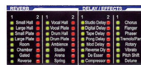
Active Reverb/Effects Matrix displays which two effects are active at all times.