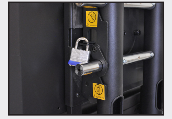
Locking mechanism and top cable management holes (padlock not included)