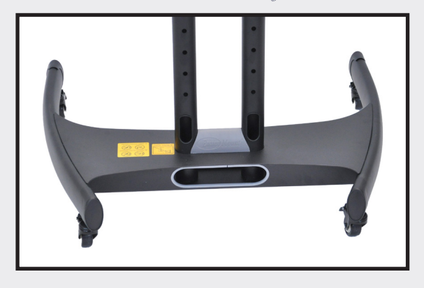
Bottom cable management holes