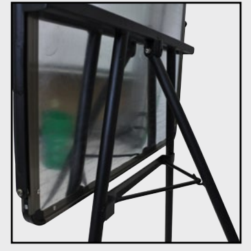
Legs Lock Into Place