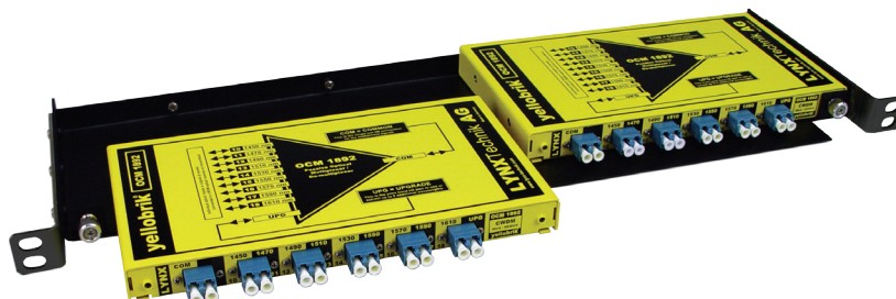
Optional RFR 1018 ½ RU 19" Rack chassis with 2 x OCM modules