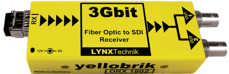
ORX 1802 LC Version Shown