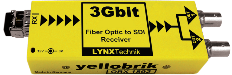
ORX 1802 LC Version Shown