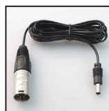
XLR 1000 Use with a standard 4 pin XLR camera battery power source.