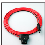
P-TAP 1000 Use with a standard battery P-TAP power source.

The kit INCLUDES AC power supply. The power adapters below are optional.