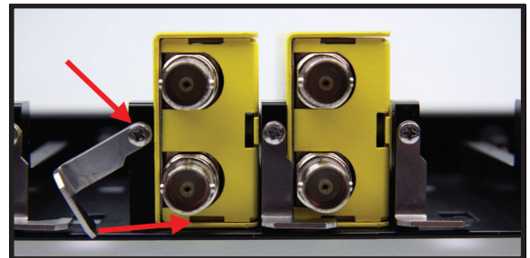
Modules are clamped securely into position