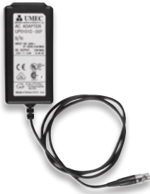
LKS-WSU Universal power supply