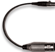
picoPA 12V to 5V power adaptor