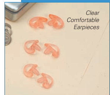
Clear Comfortable Earpieces