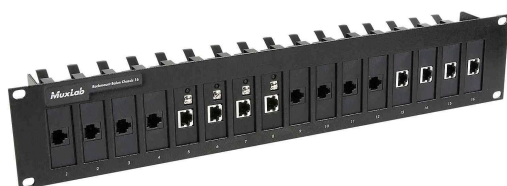
Fully loaded - front view