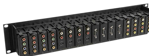
Fully loaded - rear view