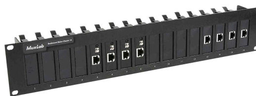
Blank Filler Modules (500901) in eight (8) slots