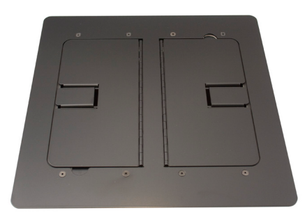
FMCA3200 Flat trim for routing into finished floor, Satin black, 1.25" x 1.25" Cable door