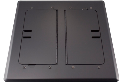
FMCA3000 Self-trimming, Satin black, 4ea 1/4"x1" Cable slot

Step 1 Select cover material and trim options: