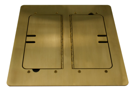
FMCA3300 Flat trim for routing into finished floor. Solid brass, 4ea 1/4"x1" Cable slot Step 2 Select four insert panel types: