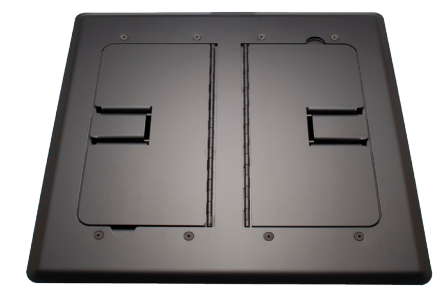
FMCA3400 Self-trimming, Satin black, 1.25" x 1.25" Cable door