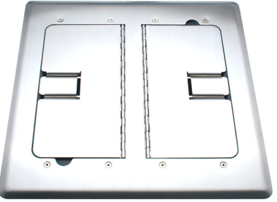
FMCA3800 Self-trimming, Stainless 1.25"x1.25" Cable door