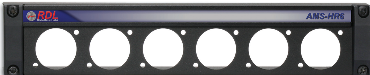
AMS-HR6 AMS Mounting Panel