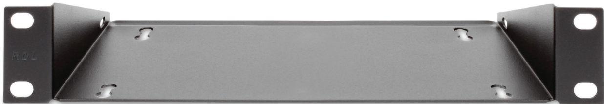
HR-HRA1 10.4" Rack Adapter