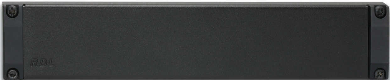
HR-FP1 Filler Panel