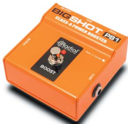
Radial BigShot PB-1 - order # R800 7220

The Radial BigShot PB1 is a combination power booster and buffer designed to provide exceptional sonic performance for pedalboard users in a compact and simple package. In boost mode it provides from 3 to 15dB of clean boost. A set-&-forget level control on the rear panel is recessed for foot stomp protection and controls the amount of boost.