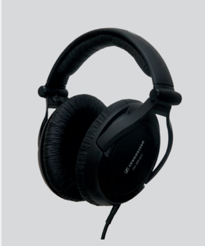
HD 380 pro Monitoring Headphones (foldable)