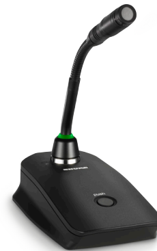
MXW8 Gooseneck Base Transmitter