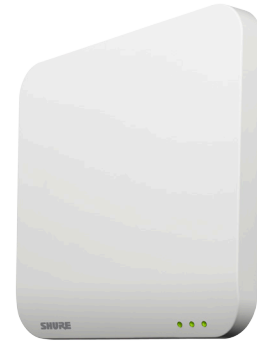
MXWAPT Access Point Transceiver