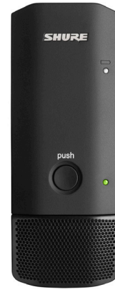
MXW6 Boundary Transmitter