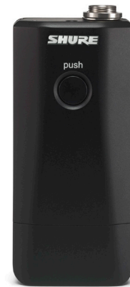
MXW1 Bodypack Transmitter