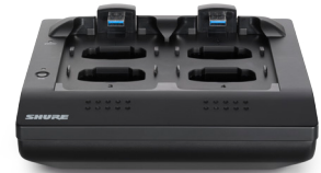
MXWNCS4 Networked Charging Station