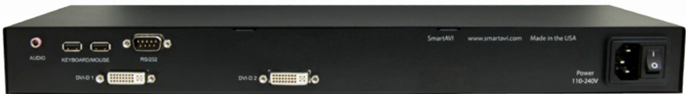
FDX-S2U Receiver Rear