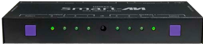
HDR 4x2 Front