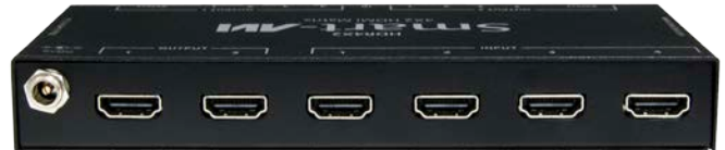
HDR 4x2 Rear