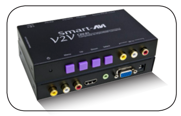
Composite to VGA/HDMI Converter