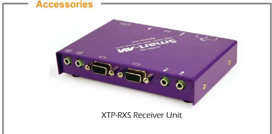
XTP-RXS Receiver Unit

Many leading businesses have already recognized the innovation of SmartAVI's technologies and have eagerly implemented them. Users of SmartAVI technology include among others;