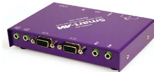
XTP-RXS Receiver Unit

Many leading businesses have already recognized the innovation of SmartAVI's technologies and have eagerly implemented them. Users of SmartAVI technology include among others;