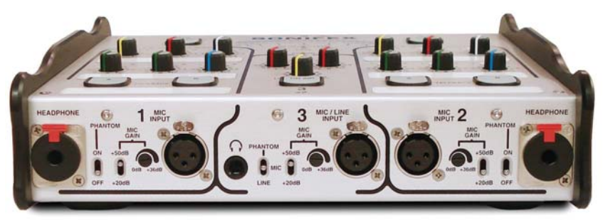
CM-CU21 Commentator Unit Front View.

A wide input gain range and switchable phantom power on each commentary