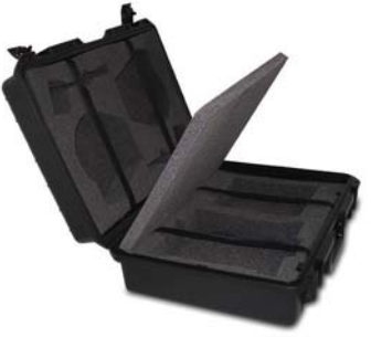
CM-CUTC Commentator Unit Transport Case.

CM-CUTC: This is an optional carry case to transport the CM-CU1 or CM-CU21 commentator unit along with 2 x headsets and 2 x ribbon mics.