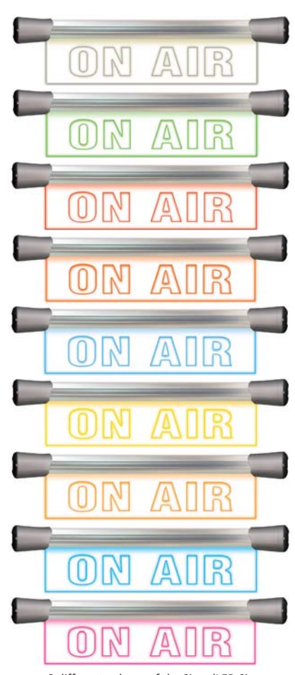
9 different colours of the SignalLED Sign.

You can configure the sign from one of 9 colours: white, green, red, blue, brick red, yellow, orange, cyan and magenta.