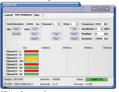
SCi User Sequence Page.