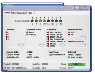
SCi Control Page.

In addition, a remote port on the rear provides a simple interface to control the unit and has several outputs to indicate which tone sequence is active.