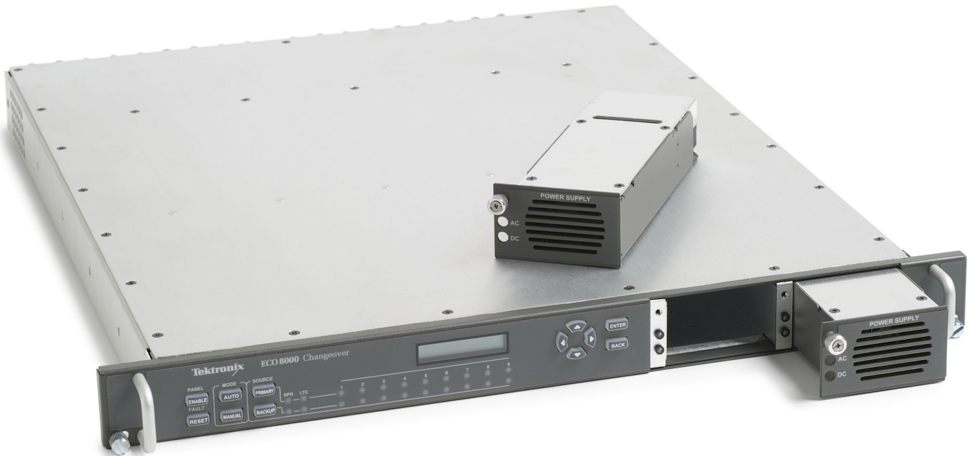
Option DPW backup power supply