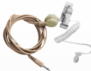
CES-2 includes: RTV-04, CMT-98, ET-4