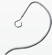
AEF-2 Plastic covered metal earloop