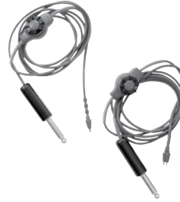
VXT-3 500 Ω volume control with 1/4" connector

The cords with in-line volume control are equipped with clothing clips for out of sight, waist-level positioning. To avoid loss of cues, the volume control will not shut off completely.