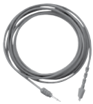
CMT-95 Straight cord with sub-miniature straight connector

The standard earset system comes equipped with a 5', low luster gray or beige cord with a 1/4" connector. A variety of other cords with or without volume controls are available as components.