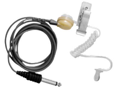
= Complete Set