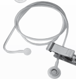
ET3 Straight acoustic eartube with clothing clip for use with earmolds or eartip