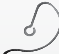
AEF-3B Nylon earloop

The nylon or plastic covered metal earloop holds the eartip or receiver in place on the ear.