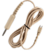
CMT-98 Straight cord with straight miniature connector