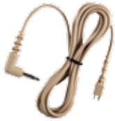
CMT-92 Straight cord with right angle miniature connector