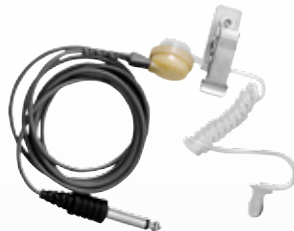
CES-1 includes: RTV-04, CMT-2, ET-4