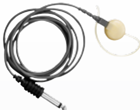
EMV-2 includes: RTV-04, CMT-2, AEF-3B