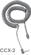
CCX-2 Coiled cord with right angle miniature connector