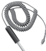
CCT-2 Coiled extended cord with 1/4" connector