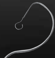
AEF-2 Plastic covered metal earloop