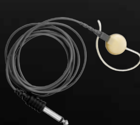
EMV-2 includes: RTV-04, CMT-2, AEF-3