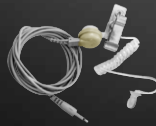
CES-2 includes: RTV-04, CMT-98, ET-4