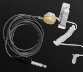
CES-1 includes: RTV-04, CMT-2, ET-4