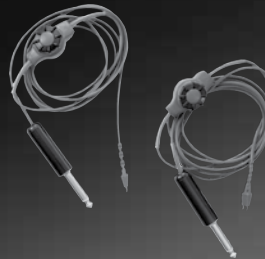
VXT-3 500 Ohm volume control with 1/4" connector

The cords with in-line volume control are equipped with clothing clips for out of sight, waist-level positioning. To avoid loss of cues, the volume control will not shut off completely.