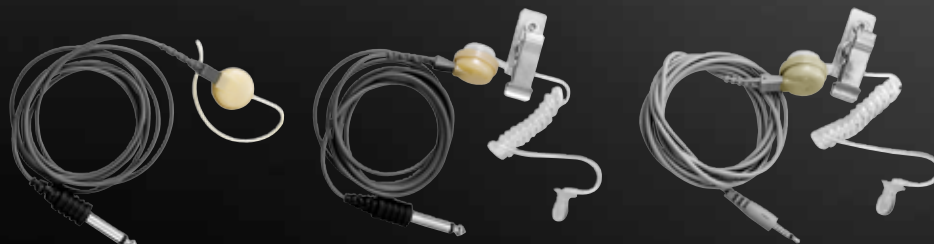
EMV-2 includes: RTV-04, CMT-2, AEF-3