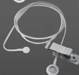
ET3 Straight acoustic eartube with clothing clip for use with earmolds or eartip