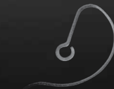
AEF-3 Nylon earloop

The nylon or plastic covered metal earloop holds the eartip or receiver in place on the ear.