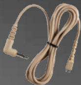
CMT-92 Straight cord with right angle miniature connector