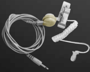
CES-2 includes: RTV-04, CMT-98, ET-4