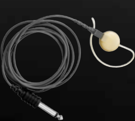
EMV-2 includes: RTV-04, CMT-2, AEF-3