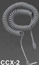
CCX-2 Coiled cord with right angle miniature connector