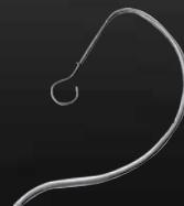
AEF-2 Plastic covered metal earloop