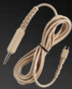
CMT-98 Straight cord with straight miniature connector