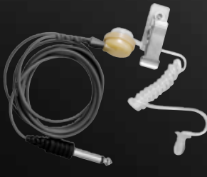
CES-1 includes: RTV-04, CMT-2, ET-4