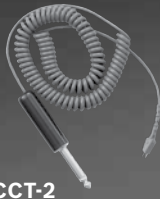
CCT-2 Coiled extended cord with 1/4" connector