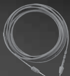
CMT-95 Straight cord with sub-miniature straight connector

The standard earset system comes equipped with a 5', low luster gray or beige cord with a 1/4" connector. A variety of other cords with or without volume controls are available as components.