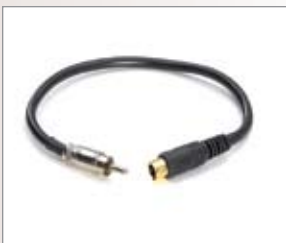
Video cable (S-video to RCA) 250-0127