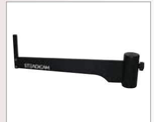
Tripod / "C" Stand Docking Bracket (Merlin) 801-7900