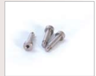
Ultra & "Master Series" low-mode gimbal screws SCW-148837