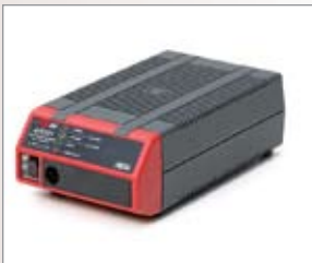
PAG 12/24 volt battery charger with auto 100-135 V/180-265 V input selector MSC-089940