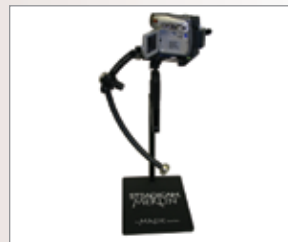
Table Top Stand (Merlin) 801-7910