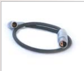
Panavision power cable 250-0049