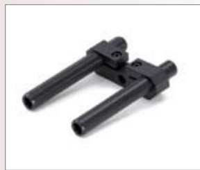
15 mm motor rod set (2 rods and mounting bracket) 250-7915