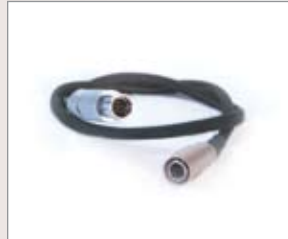
Coherent power & video cable 250-0055