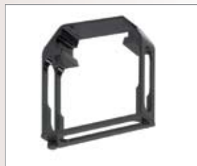
WRC-4/Seitz receiver and amplifier bracket 250-7916