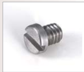
1/4-20 camera mounting screw 078-1121