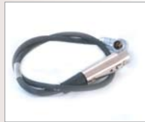
Moviecama power cable 250-0054