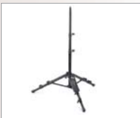
Steadistand lightweight "C" stand 601-7910