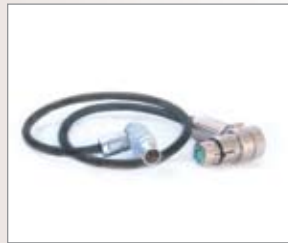
12v camera power cable 250-0045