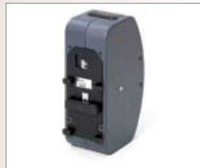
12 volt NiCd Tiffen battery with built-in meter 250-7300