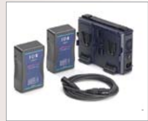
IDX E10S starter kit 2 Endura E10S lithium ion batteries and VL-2 Plus Charger FFR-000022