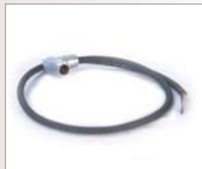
24v power cable (lemo & open end) 250-0046