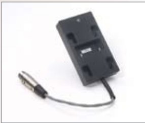
12 volt battery charger cable (Pag to Tiffen 12 V battery) 252-7915