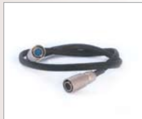
Modulus power/video cable 250-0051