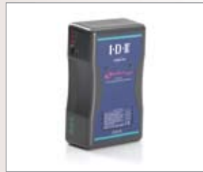
IDX Endura E10S 12 V lithium ion battery with meter FFR-000002