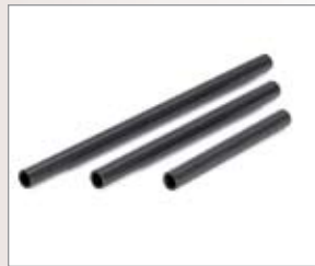
3A/EFP arm post 083-0160-2 12" arm post 083-0160-3 9" arm post 083-0160-4 6" arm post