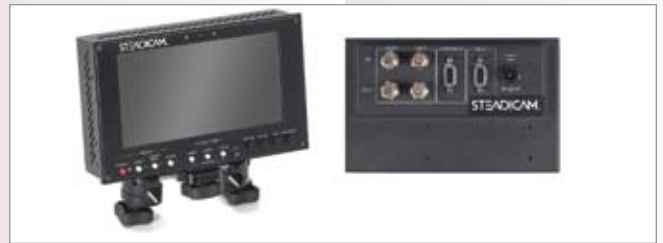
7" widescreen 16:9/4:3 HD/SDI/NTSC/PAL LCD color monitor 1/4-20 mount (front and back panels shown) 255-7500 (shown with optional 0.625" rod and 1/4-20 mount 800-7525)