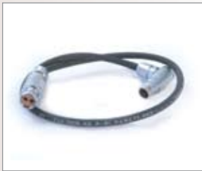
ARRI 24v power cable 250-0093