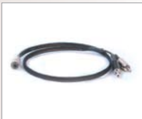
Waterc video top power & video cable 250-0076