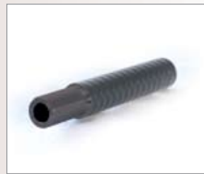
Ultra/MS arm to 3A/EFP sled, adapter post 250-7975