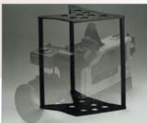
Video low mode cage with 12" rods 078-2038-01