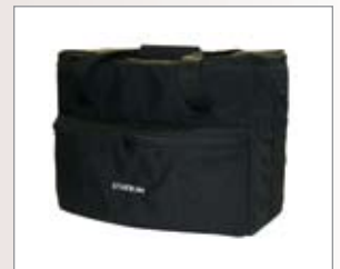
Travel Case (Merlin) 801-7902