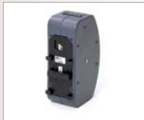
24 volt NiMH Tiffen battery with built-in meter 252-7300