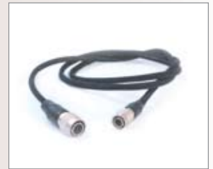
SONY XC-75 video tap power & video cable 250-0057