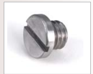
3/8-16 camera mounting screw 078-1122