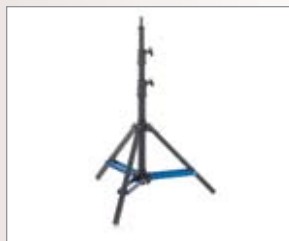
American heavy-duty "C" stand FGS-900073