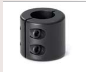
Locking spinning collar for Ultra/MS arm post 250-7211