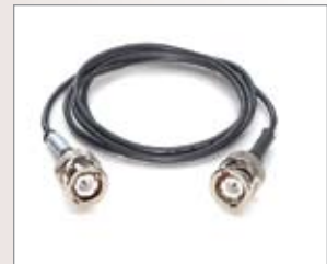
3 ft. light weight BNC video cable (BNC to BNC) 078-4122-01