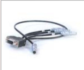
SIETZ interface cable - master series 250-0052