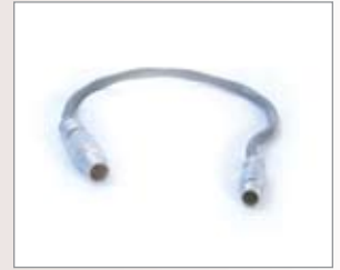
panavision millenium XL power cable 252-0054