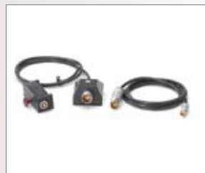
Triax interconnect kit (Fischer connector) 250-7837-01