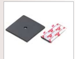
PD-150 (Sony) weight kit for JR 178-2016