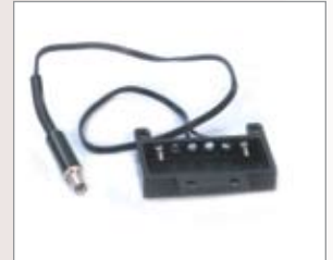
12v battery charger cable with mini jack 250-0060