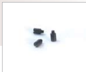
Camera locating pin screws (Flyer) 600-2005