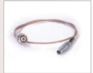
7 pin to BNC HD/SDI cable 252-7922