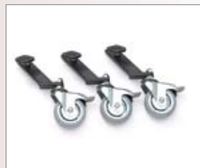
Wheel set (for American stand) FGS-900074