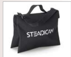
Steadicam logo dual zippered pocket sandbag with shoulder strap FFRR-000014