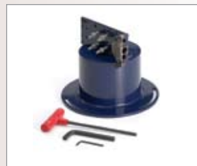
Vehicle mount kit 078-7401-01 (pictured) with steel socket block 078-7401-02 with ProVid socket block 078-7401-03 with Flyer socket block