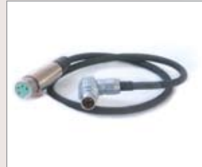
12v isolated power cable 250-0056