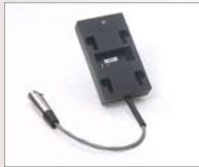
24 volt battery charger cable (Pag to Tiffen 24 V battery) 252-7915-01