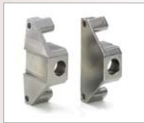
Socket block (female) 250-7233 titanium (left) 078-0419 steel (right)

Genuine Steadicam parts and accessories to keep your Steadicam original.