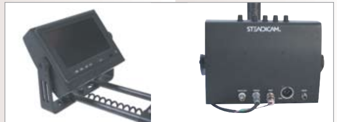
7" 700nit color LCD monitor with tally light, 1/4-20 mount. Shown with optional yoke/rod mount 302-7500-01 with framelines built-in 302-7500 without framelines