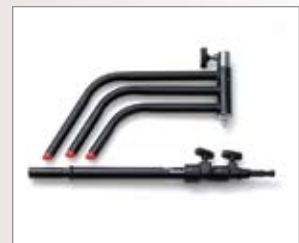
"C" stand with turtle base FGS-900041