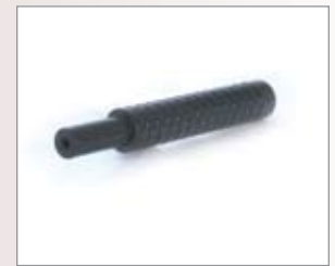
Ultra/MS arm to ProVid sled, adapter post 250-7974