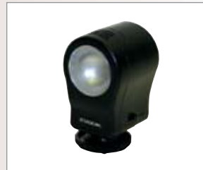
Battery Operated Obie Light (Merlin) FFR-000030