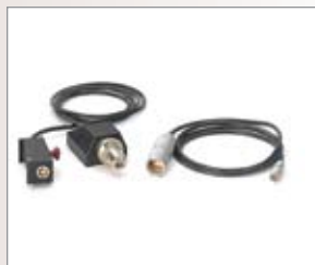
Triax interconnect kit (Kings connector) 250-7837