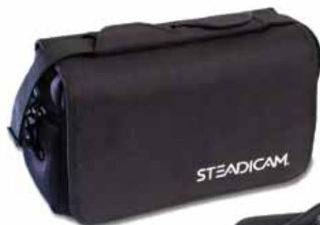
Merlin 2 ® DSLR Camera Bag