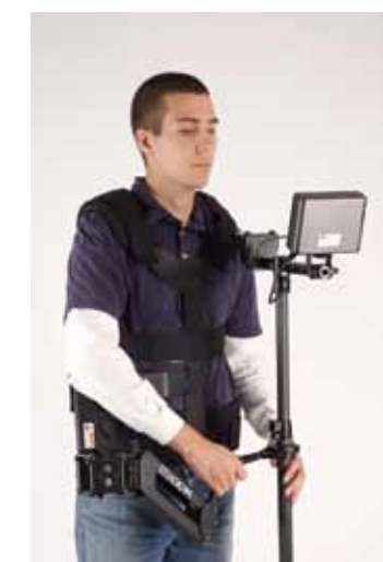
With the camera right side up in low mode, you must rotate the Pilot's monitor above the spar as shown in the photo.