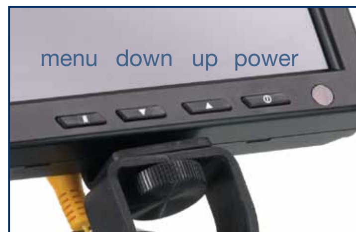
Typical monitor controls shown.

The menu screens cycle with the menu button, and there are controls for brightness, contrast, color, tint, horizontal and flip image (good for low mode operating).