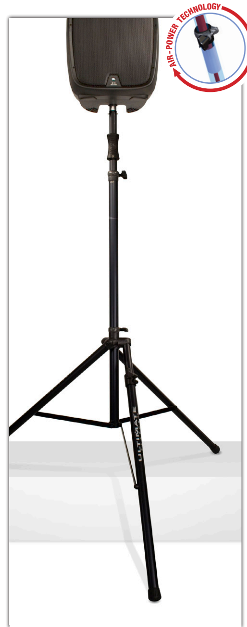
TS-110BL Air-Powered Tripod Speaker Stand - Extra Tall & Includes Leveling Leg