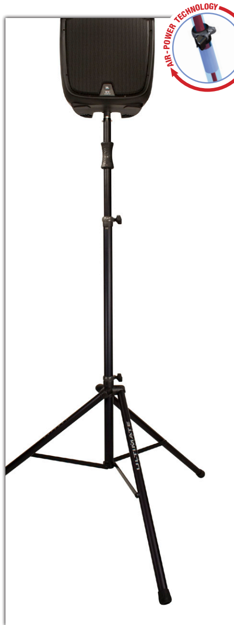
TS-110B Air-Powered Tripod Speaker Stand - Extra Tall