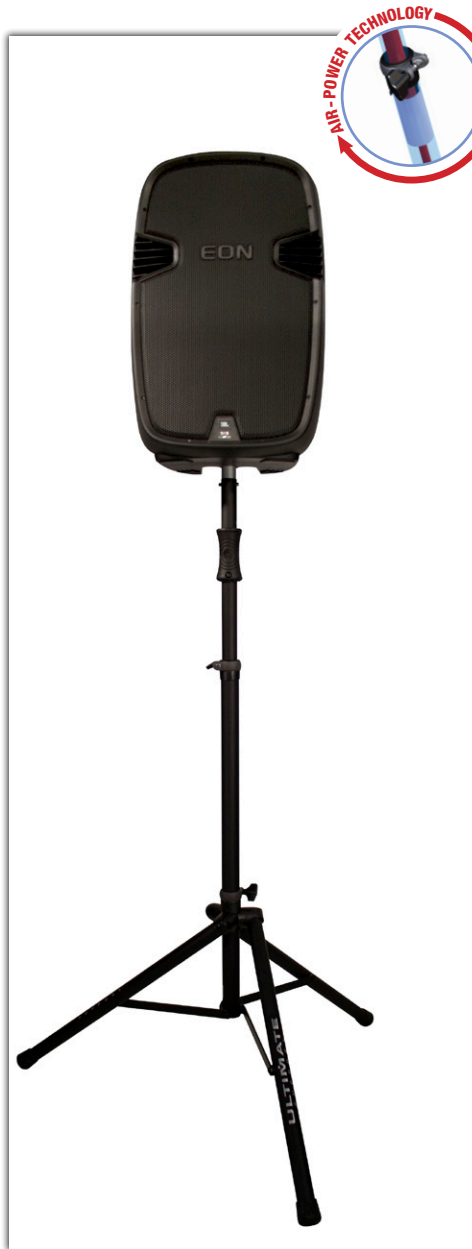
TS-100B Air-Powered Tripod Speaker Stand

Air-Powered Series speaker stands from Ultimate Support represent everything all other speaker stands aspire to be. They're incredibly strong, extraordinarily sturdy, lightweight, 100% field serviceable, AND raise and lower speaker stands on their own! Driven by innovation and years of research and development, the Air-Powered Series features an internal shock that lifts speakers weighing 50 lbs and less with no effort, and requires just one hand's worth of effort to raise speakers weighing more than 50 lbs!