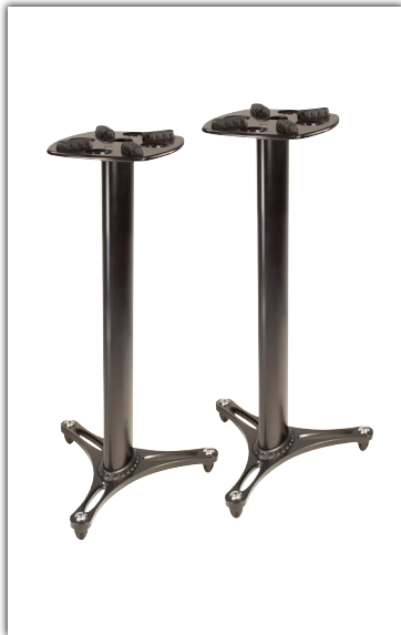
MS-90/36B 17448 Pair, Black Accents, 36"