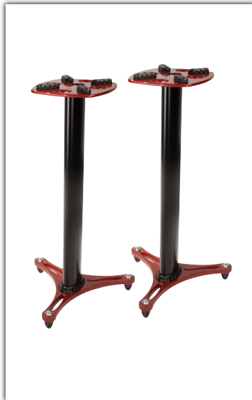
MS-90/36R 17380 Pair, Red Accents, 36"