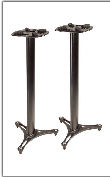
MS-90/45B 17449 Pair, Black Accents, 45"