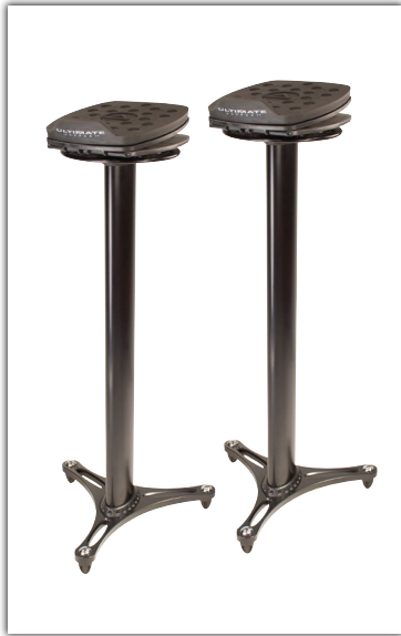
MS-100B 17450 Pair, Black Accents, 42"