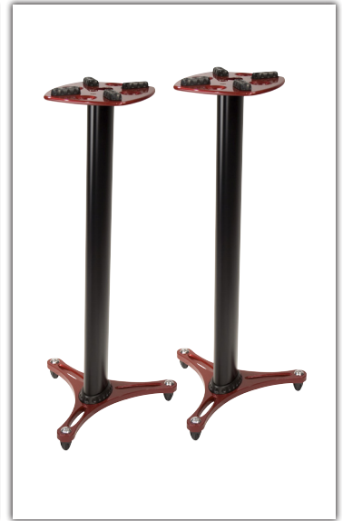
MS-90/45R 17430 Pair, Red Accents, 45"