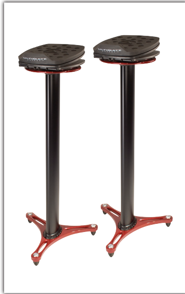
MS-100R 17381 Pair, Red Accents, 42"