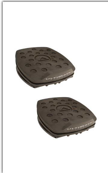
MS-80B 17379 Pair, Desktop

ULTIMATE SUPPORT™ LIMITED LIFETIME WARRANTY