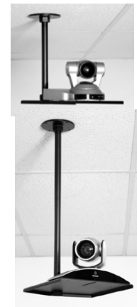
Figures 3 & 4:

Figure 3 (left): 26" extension with Vaddio HD-18