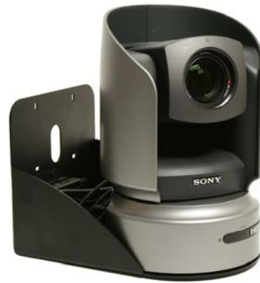
Figure 1: (top) Quick-Connect CCU 1 RU rack mount interface; (bottom) WallVIEW CCU H700 System with Camera, EZIM and Wall Mount

The Vaddio WallVIEW CCU H700 is built around the Sony® BRC-H700 high definition pan/tilt/zoom camera. With three CCD mega-pixel sensors and a 12x optical zoom lens, the WallVIEW CCU H700 is an ideal choice for a wide range of high definition video applications. WallVIEW CCU H700 allows the user to adjust the color; gain and iris functions on the camera (see Figure 1). These controls allow the camera to deliver a more accurate representation of the image that is being captured. The other added advantages include the ability to color match multiple cameras and eliminate the need to use automatic exposure and color settings. User-defined adjustments may be stored using two Scene buttons. The WallVIEW CCU uses high speed differential signaling (HSDS), an active video transmission system, to deliver high quality HD video over standard Cat. 5 cabling. Adjustments allow the video to be extended up to 500 feet from the Quick-Connect CCU with virtually no loss in video quality.