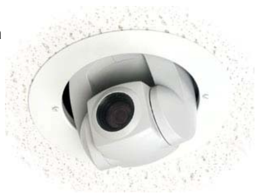
Figure 1: CeilingVIEW 70 PTZ

The Vaddio™ CeilingVIEW 70 PTZ is a complete, half-recessed, ceiling-mounted pan/tilt/zoom camera system. The system features a Sony EVI-D70C/W camera mounted into a recessed, metal ceiling camera enclosure backbox with ceiling tile support braces and the Vaddio EZCamera™ Cabling System. The EZCamera Cabling System allows the installer to use Cat. 5 cabling to run power, video and camera control. Also included is the Vaddio PowerRite™ power supply that regulates the right amount of power needed for the camera over Cat. 5 cabling. The CeilingVIEW 70 can be controlled with the IR Remote Commander or with RS-232.