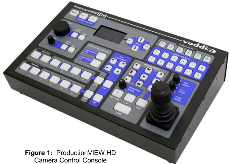
Figure 1: ProductionVIEW HD Camera Control Console

In our relentless drive to redefine camera control, Vaddio introduces the ProductionVIEW HD multi-camera control system. Designed to handle the most demanding live broadcast or staging events, it's still simple enough to allow a novice to shoot like a pro. ProductionVIEW HD integrates PTZ camera control and multi-format HD/SD live switching with real-time graphics and effects into one easy-to-use control console.