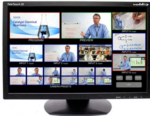
Image: TeleTouch 22" Multiviewer Touch Screen (P/N 999-5520-022)