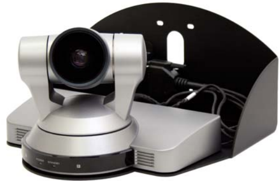
Figure 1: (top) Quick-Connect CCU 1 RU rack mount interface; (bottom) WallVIEW Universal PRO HD1 System with Camera, EZIM and Wall Mount

Overall, the WallVIEW CCU HD1 is superb for a wide range of high definition shooting applications. It is also highly suitable for applications where adjusting the color and brightness levels of one or multiple cameras is critical, such as houses of worship, corporate boardrooms, live event production and distance-learning applications.