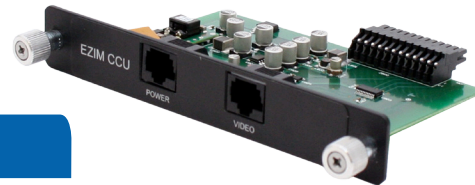
EZIM Slot Card fits into the card slot of the HD-20, HD-19 and HD-18 Cameras