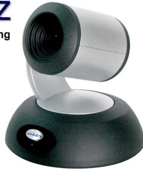
Image: RoboSHOT 12 HD PTZ Camera

The key features of the RoboSHOT cameras are Tri-Synchronous Motion, the silent direct drive pan/tilt motors, advanced Exmor® image sensor, multi-element lens and ISP (image signal processor) combination.