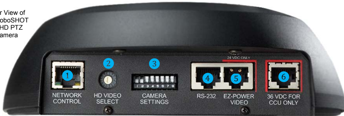
Rear View of the RoboSHOT 12 HD PTZ Camera