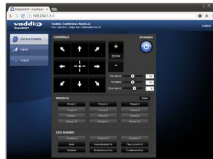
Example: Built-in Camera Control Web Page

The RoboSHOT cameras were designed for the times and represent a new era in specifying and integrating professional quality cameras into A/V and conferencing system configurations. In short, it has never been easier to integrate cameras into any small to medium room project than with the RoboSHOT 12.