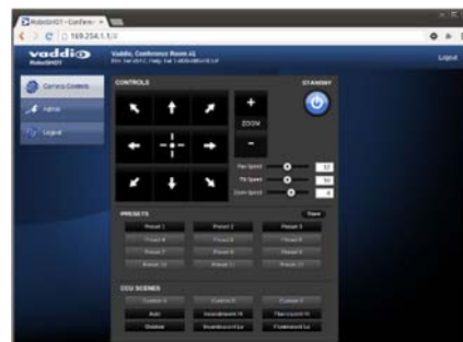
Example: Built-in Camera Control Web Page