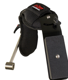
New swiveling counterweight pictured.

The DV Media Rig is covered by a 2-year parts & labor warranty against defects. If you have any questions, give us a call or shoot us an email – www.varizoom.com