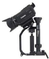
Handheld / Holster / Table rest mode