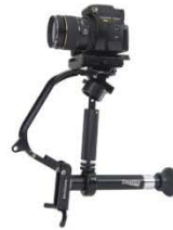
3-point Shooter / Tripod mode