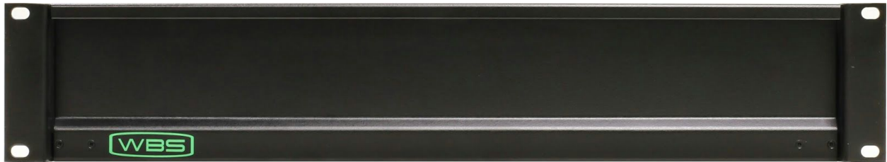
MF8212 FRAME REAR